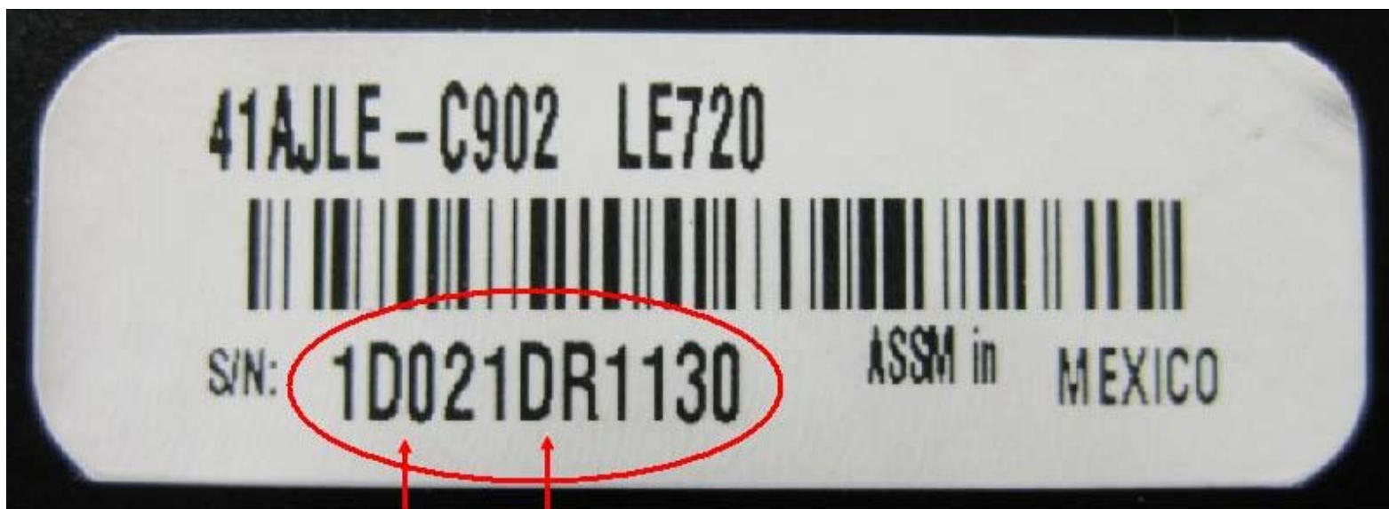
Label with an example of a serial number