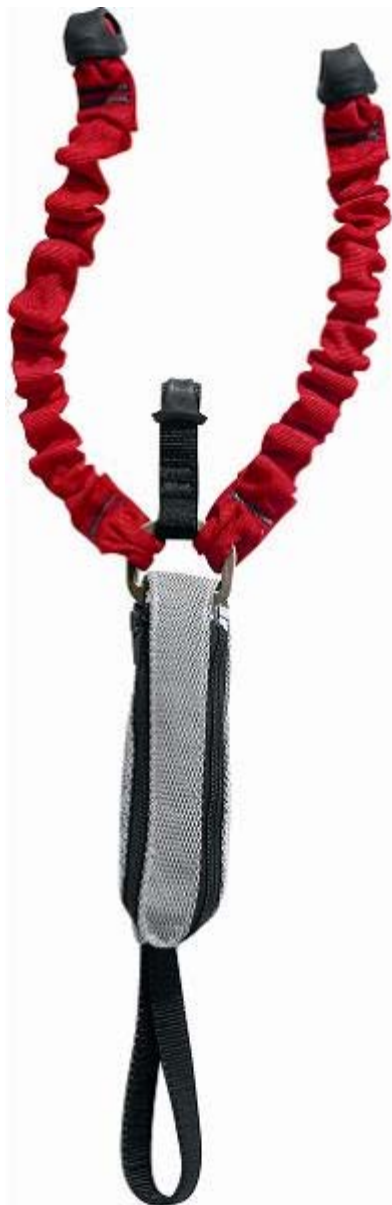
SCORPIO L60 2005 to Present