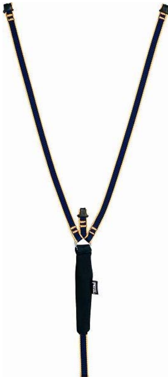
SCORPIO L60 2002 to 2005