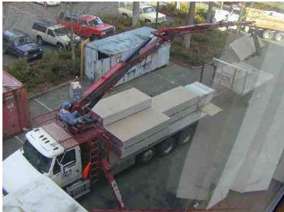
Figure 13. Rotation from stocking (lifting panels) to boom truck operation (for stockers trained for boom truck operation).