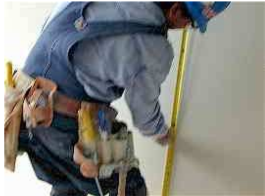
Figure 5a, 5b. Rotation from screw gun use (left) to other installation tasks (e.g., measuring/marketing (right), cutting and installing panels.