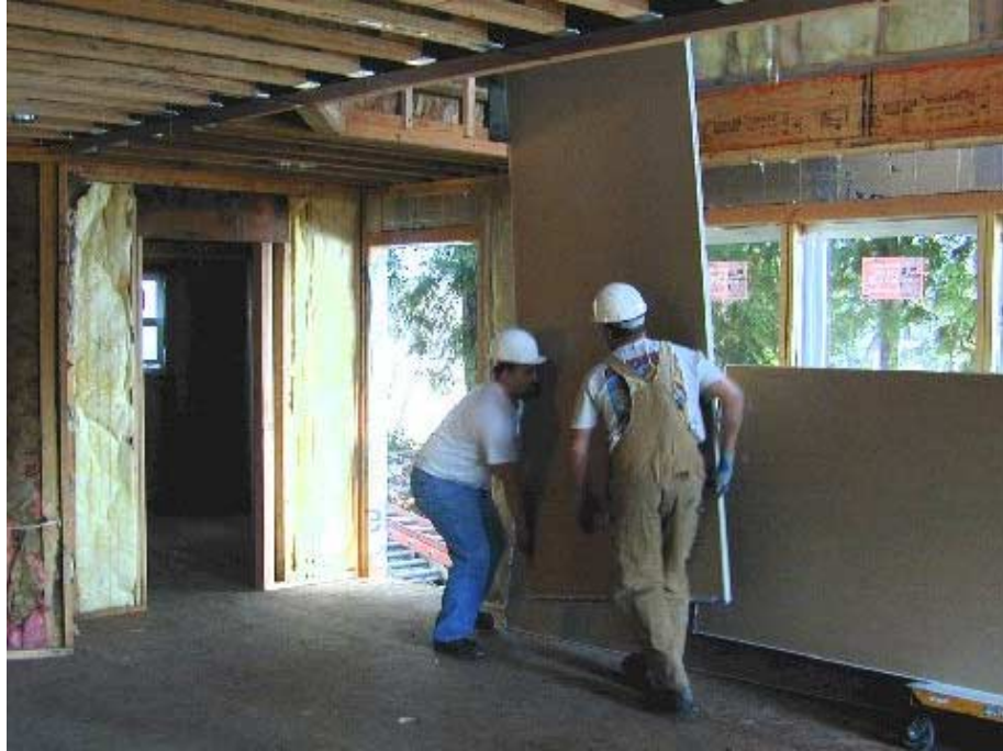
Figure 12. Lack of hatch access requires lifting panels up to second floor.