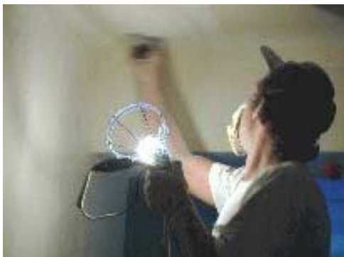
Figure 8e. Sanding.

Figure 8(a,b,c,d,e). Finishing Tasks/Tools – Bazooka, Box, Trowel, Sanding. Rotation between different tasks/tools can be used to reduce risk factor exposures.