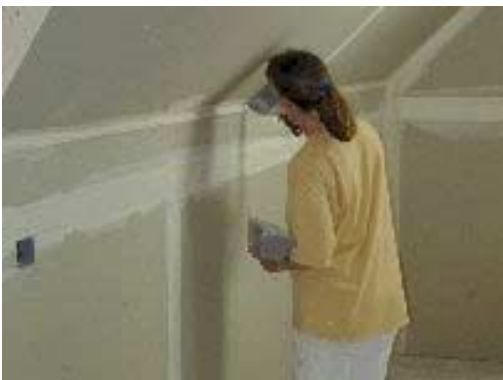
Figure 8c. Trowel use.