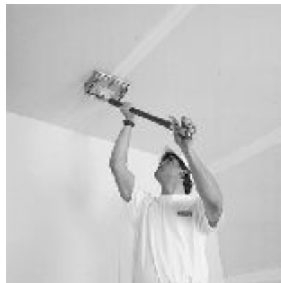
Figure 10. Box use – prolonged use is fatiguing and can be stressful to the upper body.