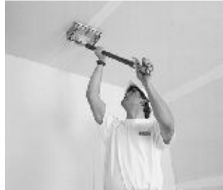
Figure 8b. Box use.