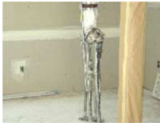
Figure 9. Stilts use – prolonged use can be stressful to legs, back.