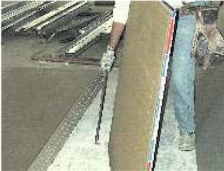
Figure 6. Panel carrier handle puts hand at a good height from the floor for lifting.

Less back bending than reaching down to the floor to lift. Panel does not block worker's vision when panel is carried at this height.