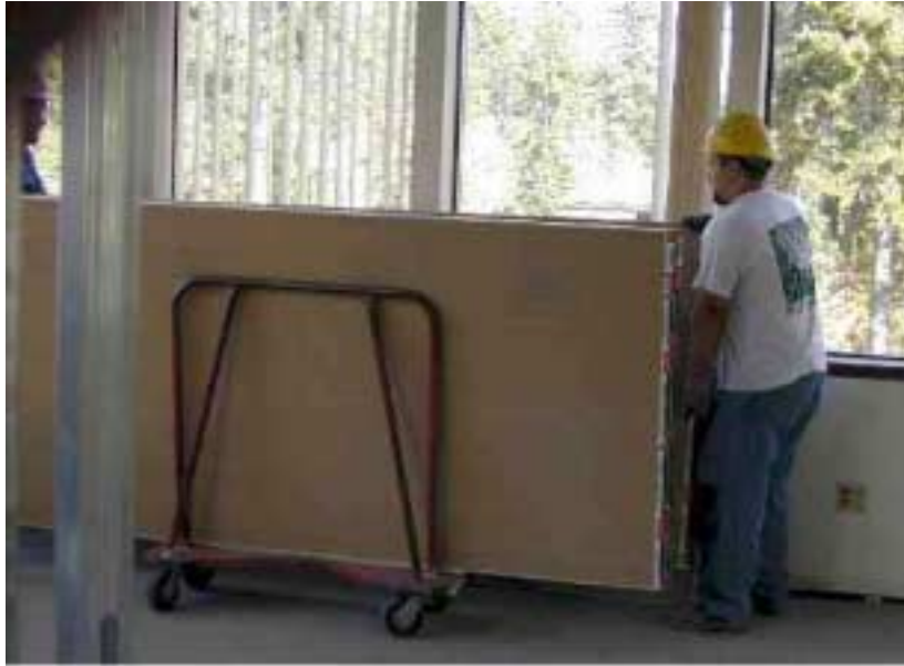
Figure 4. Proper panel stocking distribution around the worksite -- minimizes the need for installers to do incidental stocking.