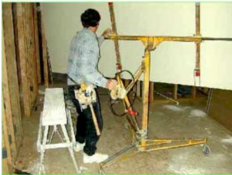
Figure 3. Panel lift used to lift and hold panels.