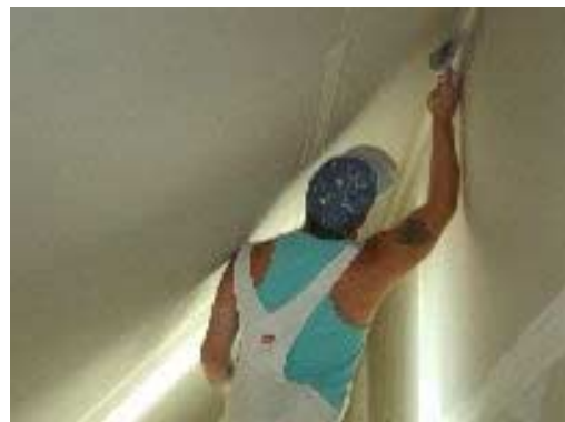
Figure 8d. Trowel use.