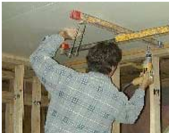
Figure 7. Screw gun use.

Sanding risks can be reduced by rotation to other tasks, and by changing a pinch grip of sandpaper to a whole hand grasp of sandpaper/block (where possible). The whole-hand grip is much stronger than the pinch grip.