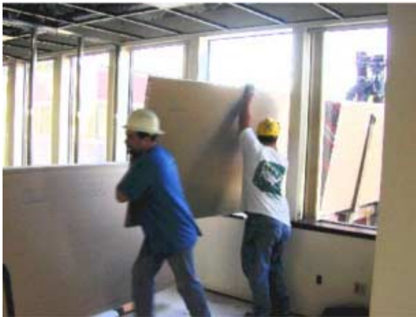
Figure 11. Teamwork used for loading carts via hatch access.