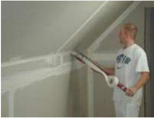
Figure 8a. Bazooka use.

Figures 8a, 8b, 8c, 8d show several different finisher tasks/tools. Rotating between tasks/tools with different risk factors can reduce risk of injury.