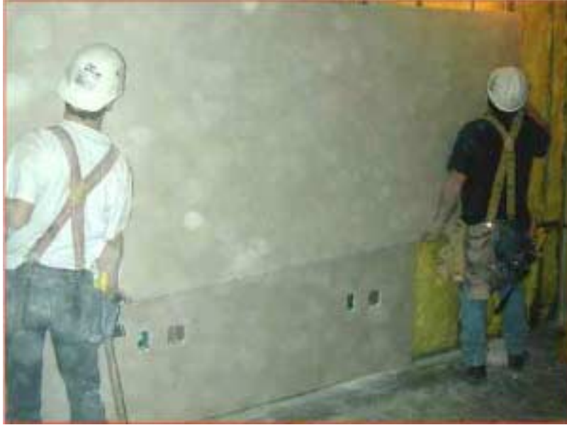
Figure 2. Two-worker panel lifting.