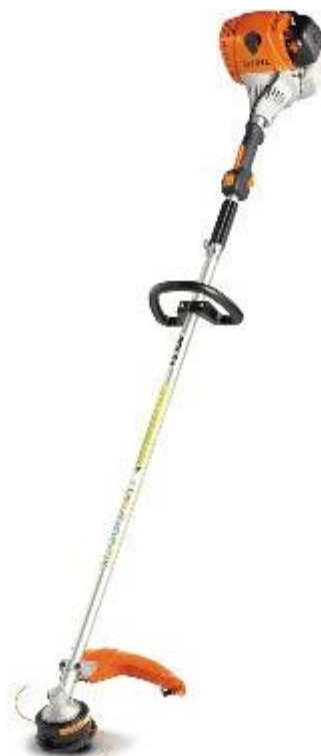
FS 110 R