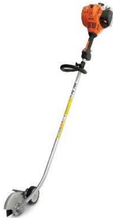
FC 70 C-E